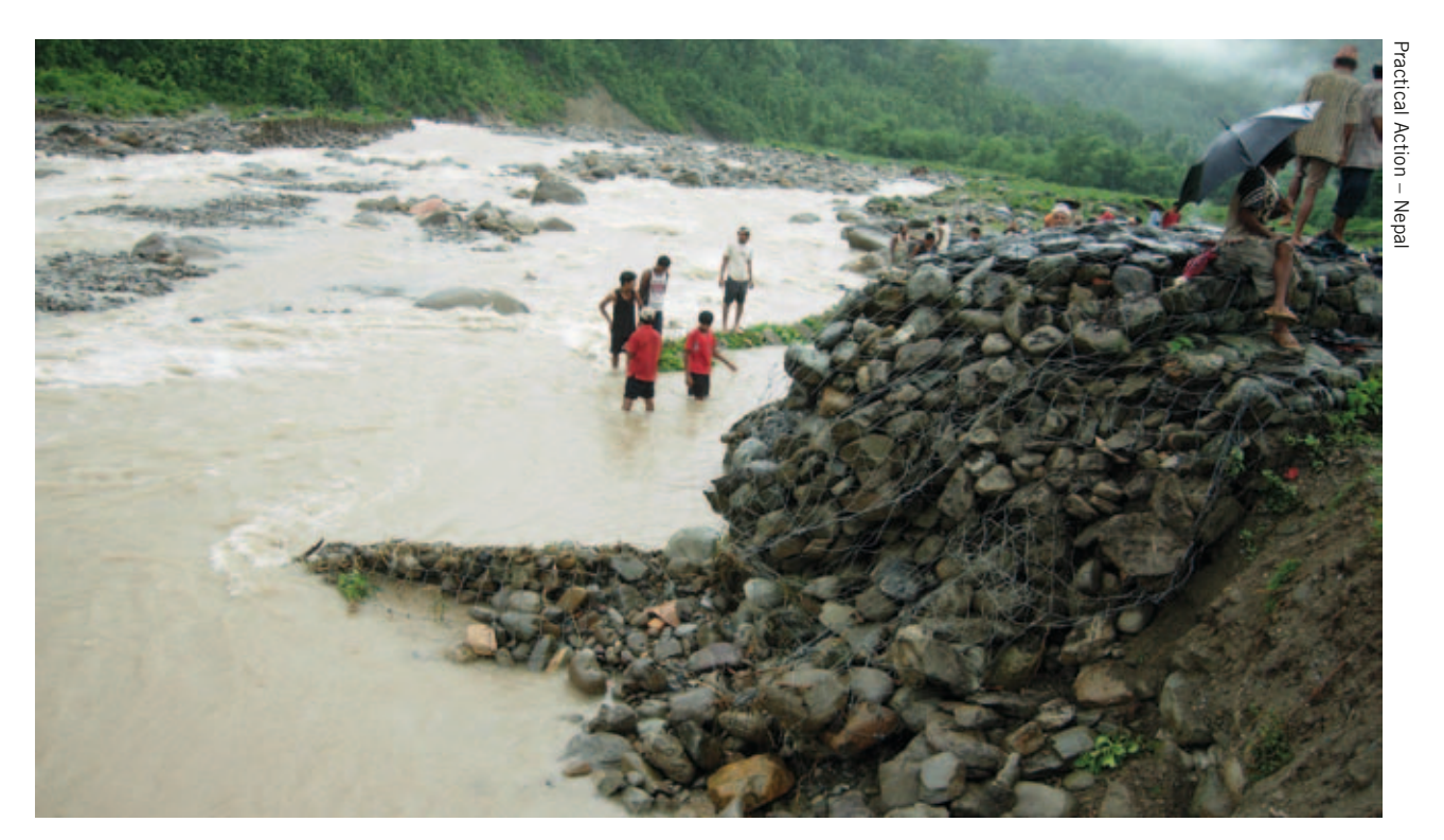
Repairing flood-damaged irrigation inlet