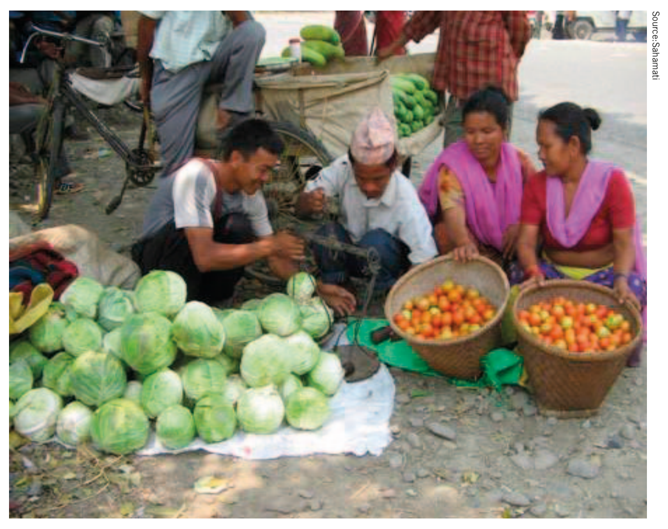
Kritipur farmers selling vegetables

The main practical recommendation for future LCDRR projects emerging from the assessment is that Practical Action should give serious consideration to making cost-benefit analysis an integral accompanying component of future LCDRR projects from the project planning and inception phases onwards. While a backward-looking cost-benefit assessment at the end of a project is certainly commendable, the CBA approach is potentially most powerful, when it is used as a forward-looking planning and decision support tool to assist in channelling scarce project resources into activities with the highest expected net benefits.